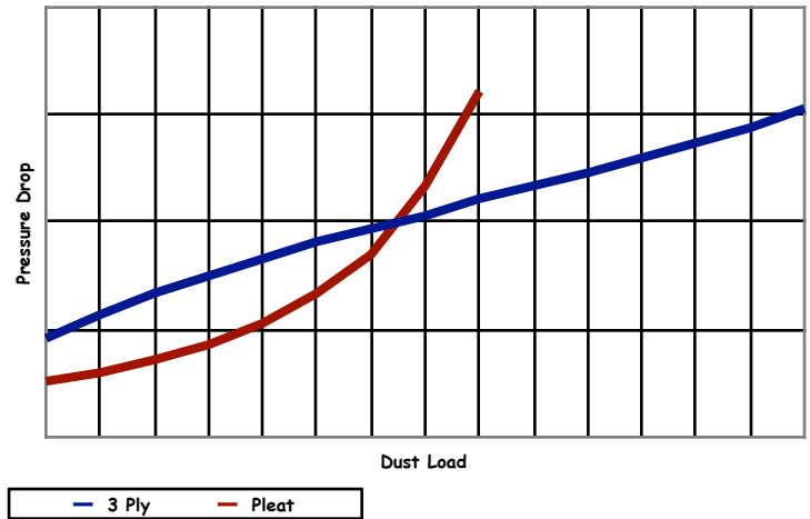
RESISTANCE vs. DUST LOADING

TRI-DEK ROLLUP filters also offer extended service life over pleated filters by 'managing' the dirt in a depth-loading media. The graph to the right shows the results from a laboratory test that confirm that TRI-DEK 15/40 will outlast a high capacity pleat - these results show a 75% longer life for TRI-DEK, that is nearly twice the service life. This translates into huge savings by reducing the number of filters you need to purchase, reduced shipping storage cost, reduced labor cost and reduced disposal cost just to name a few areas where savings will be generated.