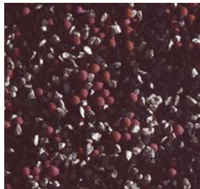
Carbon, Impregnated Alumina and Zeolite Blend