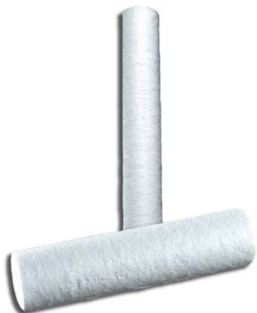
Figure 1: Purtrex Depth Cartridge Filters